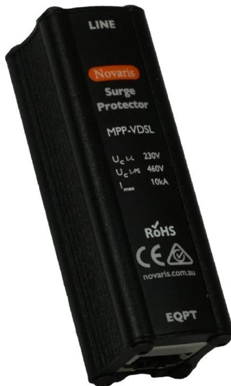
Figure 1 MPP-VDSL surge protector

The MPP-VDSL is also provided with a number of adaptors to allow different connectors to be used, these are an RJ12 reducer and a two-way terminal block, shown below in Figure 2.